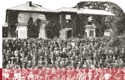
1904 Welsh Revival