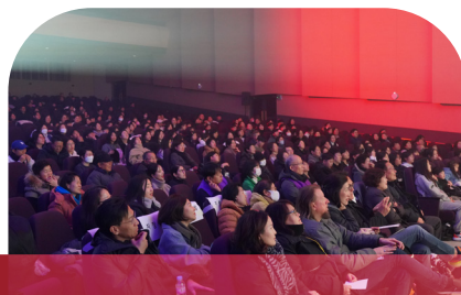
2023 Again 1907 Pyongyang Revival Convention started - Present