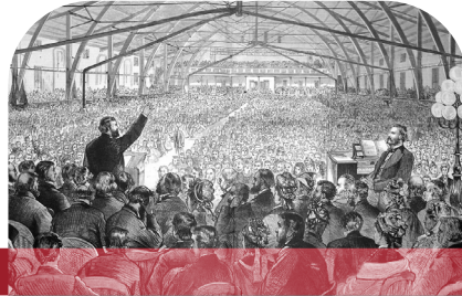
1875 Moody Revival