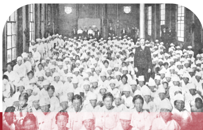
1907 Pyongyang Revival