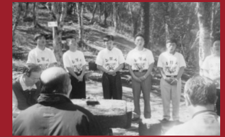
1998 Light Unto the Nations Ministry begins ministry to North Korean defectors (in China)