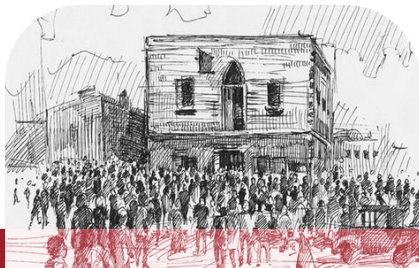
1906 Azusa Revival