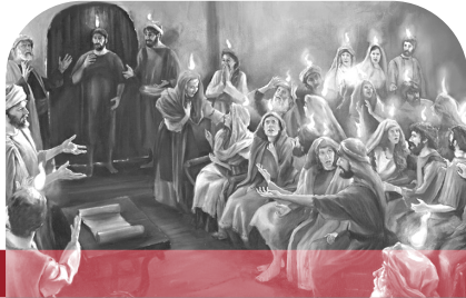
Mark's Upper Room Revival at Pentecost after Jesus' Ascension