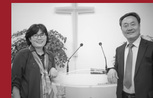
2011 Golden Bell Church established - Present