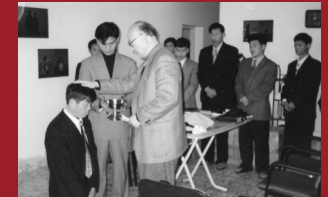
2008 Second North Korean defector ministry (in China)