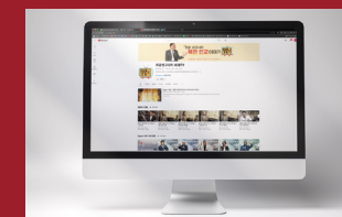
2020 YouTube channel NaeraeTV launched - Present